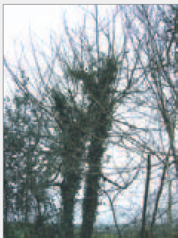
Ivy provides ideal cover for grey squirrels

Grey squirrels usually live in dreys (nests), forks or hollows in trees. High-risk areas include young broadleaf trees close to older broadleaf trees.