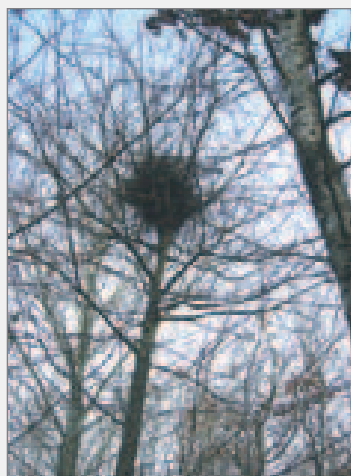
Grey squirrel drey