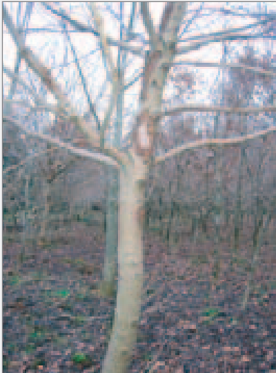
Scar damage on high-risk species