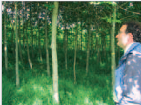
Monitor your crop regularly for signs of damage.