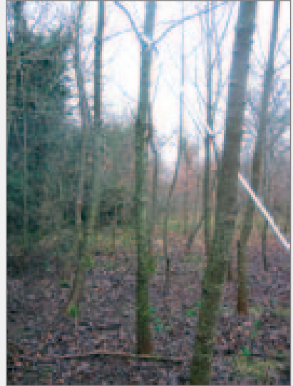
Prune lower branches to make trees less accessible